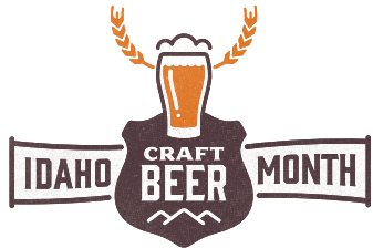
PRIMARY 1: NO BACKGROUND

USAGE: Primary Promotional Items, Apparel, Vendor Promotion