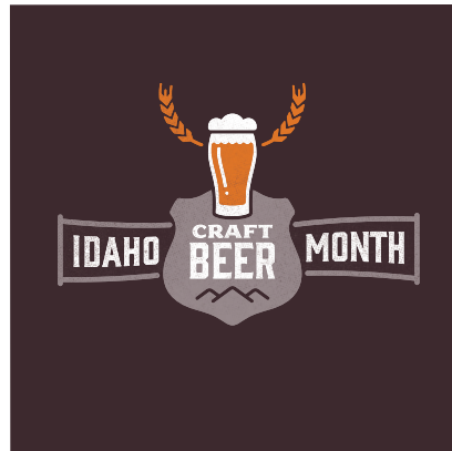
PRIMARY 2: ON BACKGROUND