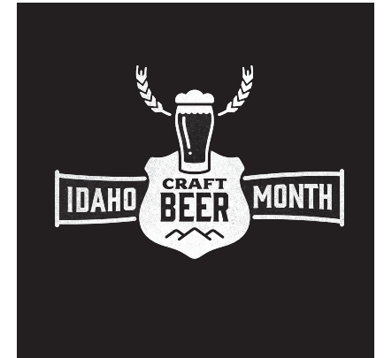
PRIMARY 4: B+W ON BACKGROUND