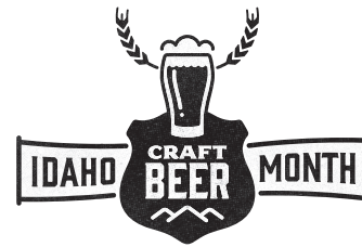
PRIMARY 3: B+W NO BACKGROUND